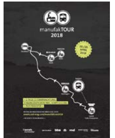
manufakTOUR: 4 sponsors, 2 day, 40 participants