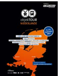
Exclusive “manufakTOUR” and “ObjektTOUR”: 1 sponsor, 2 days, 40 participants