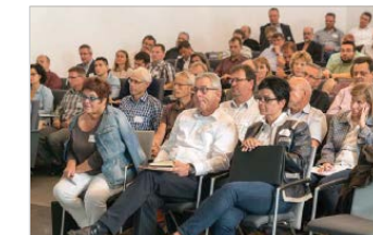
Impressions from "Tag der PSA"

The Si-Academy for Health and Safety at Work co-operates closely with the respected trade journals Sicherheitsingenieur (Security Engineer) and Sicherheitsbeauftragter (Safety Officer). Their training courses are aimed at Safety Engineers, specialists in Occupational Safety, Safety Officers, Ergonomists, BGM Officers, Executives and Health Management. Within the area of Ergonomics, there is also official co-operation with the Interessengemeinschaft der Rückenschullehrer/innen e.V. (IGR).